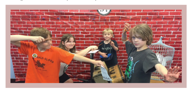
Magical fun at the library's Harry Potter event!